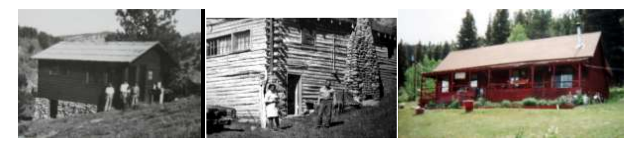
Cabins then and now

bedrooms and over time a tavern, a honeymoon cabin, an "orange cabin", a "tin house", and a "threeplex cabin" were added.