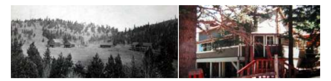
Early place of beauty to establish an Oasis